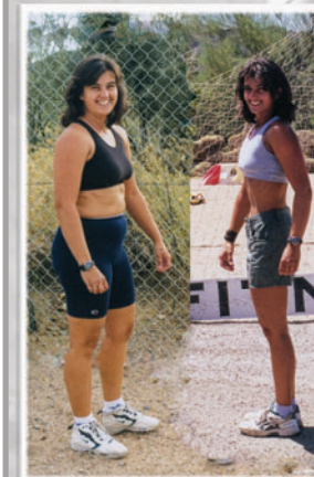
Before & After